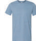
Heather Indigo Blue