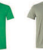
Heather Military Green*