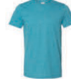
Heather Galapagos Blue*