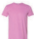
Heather Radiant Orchid